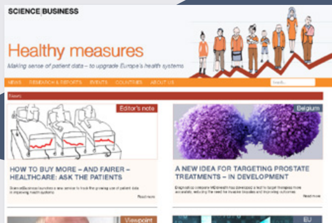
The Healthy Measures news service at www.sciencebusiness.net/health

Our objective: To move this issue from talk to action, from debate to decision. And to make healthcare in Europe more effective, efficient and fair.